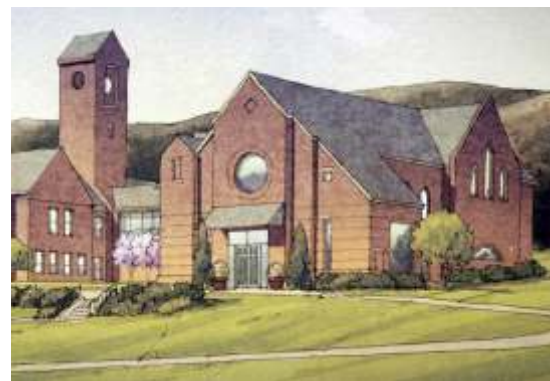
Drawing of planned church to be attached to the existing monastery.

Relief is on the way. Groundbreaking will take place soon for a long-awaited $2.8 million church. The two-story structure, expected to be completed in early 2016, will be connected to the monastery and contain space for a relocated library, a welcome center, and a cheese sales area. Donations and cheese sales are providing much of the financing.