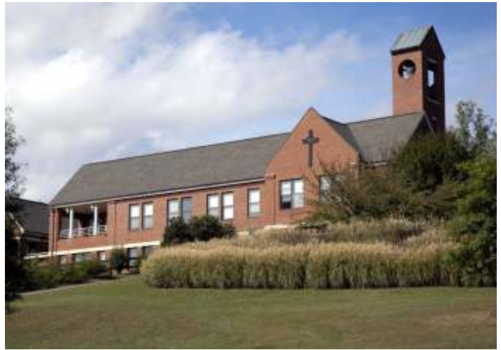
Our Lady of the Angels Monastery

A batch of cheese is started at 4:30 in the morning and completed by 4:30 in the afternoon. By adding the culture to the pasteurized milk, the mixture is transformed