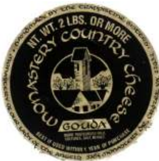
The black and gold cheese label was designed by a monastery nun.