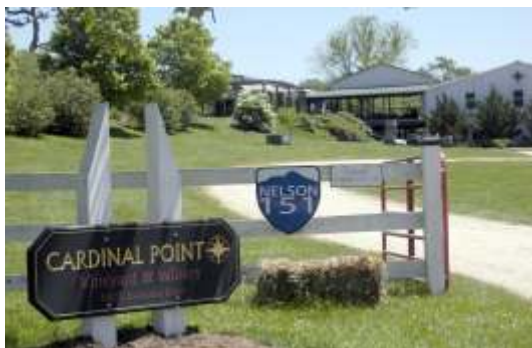
The entrance to the Cardinal Point Vineyard and Winery on Batesville Road near Afton.