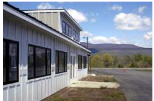
The mountain view as seen from the brewery under construction.

Schoeb thinks the brewery name he chose will be especially appealing to everyone in the medical community since they are all familiar with the Latin phrase abbreviation, prn, used on prescriptions meaning "as needed." "I hope everyone will come to Pro Re Nata as needed," quips Schoeb.