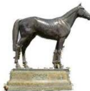
The statue of Citation stands at the legendary Hialeah Park race track.

The company moved to the East Main Street location in the 1940s, occupying a 1926 building that had been vacated by Stehli Silk Company and adding the other buildings on the site to accommodate a growing business. The complex, now owned by an investment group from Harrisonburg, includes a house estimated to have been built in 1890 and used by Metalcrafters as a showroom. The property has been nominated for listing on the Virginia Landmarks Register.